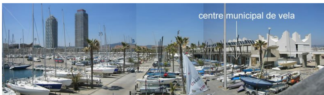
location of the Centro Municipal de Vela inside the Port Olímpic of Barcelona

CENTRO MUNICIPAL DE VELA: is situated on Moll de Gregal, inside of the Port Olímpic de Barcelona. If you come by car, you take the Ronda Litoral and there is a parking by Port Olímpic. If you take the metro, you need to take Line 4 (yellow line) and stop at Villa Olímpica-Ciutadella.